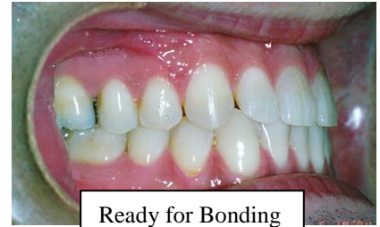
Ready for Bonding