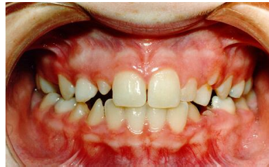
Above: patient with pegged right lateral & small left one.

Many patients today have very small or missing lateral incisors. Latest reports indicate that approximately 10% of patients have very small or missing lateral incisors. The lateral incisors can also have various shapes including pegged shaped, cone shaped and a little nub. They can be missing altogether or