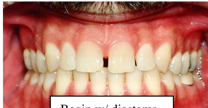
Begin w/ diastema