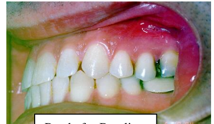
Ready for Bonding