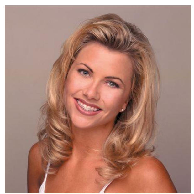
She has Clear Ceramic Braces!

For some, early diagnosis and early treatment may be appropriate. It is recommended that children get an orthodontic check-up no later than age 7. Adults may have special considerations that may require inter-disciplinary care, which, of course, would be coordinated by your family dentist. The goal of every orthodontist is to provide each patient with the most appropriate treatment at the most appropriate time. By working together, we (dentists and orthodontists) can give our patients beautiful, healthy smiles that are good for life!