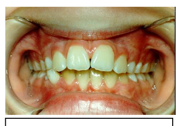
Narrow arches and overjet