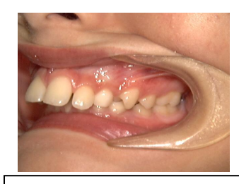
Severe overjet; severe protrusion of upper anterior teeth